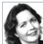
Dr. Ellen Taaffe Zwilich 1992 Co-Recipient Beta Gamma Chapter, Florida State University Pulitzer Prize-winning composer