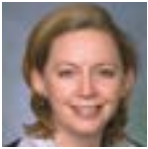
Deborah Platt Majoras 2006 Recipient Delta Omega Chapter, Westminster College Chairman of the Federal Trade Commission