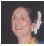
Lynda Johnson Robb 1998 Recipient Kappa Chapter, The University of Texas at Austin Philanthropist, humanitarian and volunteer